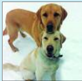
Version L reads: "Often, we are asked why dogs raised by inmates are so successful. Truthfully, the odds are stacked in our favor."