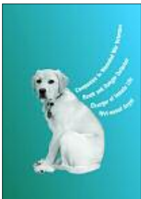
Version J reads: "Companion to Wounded War Veterans, Bomb and Danger Detector, Changer of Inmate Life, Wet-nosed Angel." Inside it reads, "You're an angel. Happy Holidays."