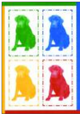
Version C reads: "Paws and Give Thanks."