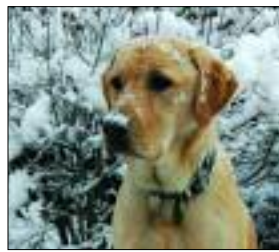
Version K reads: "Some stars prefer not to hang out on the top of pine trees."