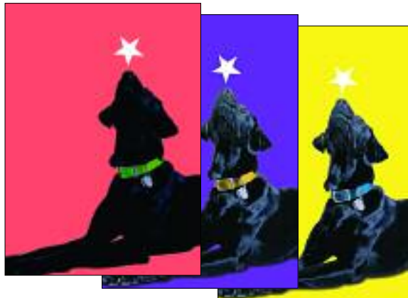
Version E (red background), F (purple), G (yellow) reads: "The best place to find a miracle is to follow a star."