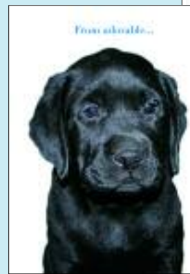
Outside it reads, "From adorable..."