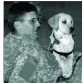
Version H reads: "For our women and men in the services, there's no replacement for family during the holidays. However, that does not stop us from trying to fill the gap."