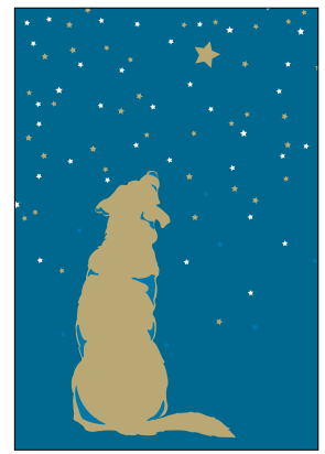
Version B reads: "Peace, from the stars who train, assist and detect."