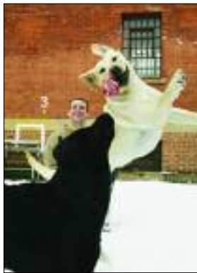
Version D reads: "Joy Unleashed."