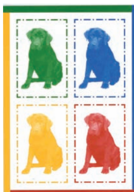
Version 4 reads: "Paws and Give Thanks."