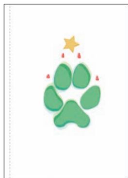
Version 3 reads: "Peace, from the stars that guide and detect."