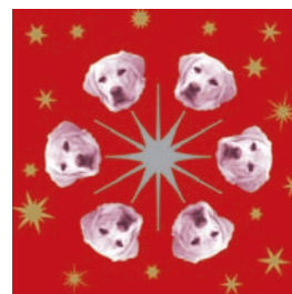
Version 7 reads: "Now Major! Now Dover! Now Kinder and Quentin! On Holly! On Thurgood! On Carter and Devon! At Puppies Behind Bars, Miracles Happen Year-Round."