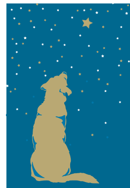
Version 2 reads: "Peace, from the stars who train, assist and detect."